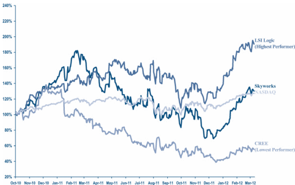
Skyworks Solutions, Inc.'s Relative Stock Performance Against Highest and Lowest Performing Peer Group Members and NASDAQ Composite Index Fiscal Year 2011 to Present (October 2, 2010 to March 23, 2012)

Part of the goal of our executive compensation program is to reward our executive officers for increases in stockholder value and long-term performance and to align their interests with those of our stockholders. We aim to accomplish that goal by providing a significant portion of their overall compensation in the form of long-term stock-based compensation, mainly performance share awards and stock options, which we hope will drive the creation of sustainable stockholder value. We think that the performance of our stock during fiscal 2011 relative to that of our competitors and the NASDAQ Composite Index in light of the challenging economic conditions and general downturn in equity markets plus the recent performance of our stock price is an indication that our compensation program has incentivized our executives to focus on the long-term performance of the Company and to increase overall stockholder value and has been successful in aligning the interests of our executives with our stockholders. The performance graph set forth below shows Skyworks' relative stock performance against the members of Skyworks' "Peer Group" (as described below in the Compensation Discussion and Analysis) having the highest and lowest stock performance, as well as the NASDAQ Composite Index, from the beginning of fiscal year 2011 to the present.